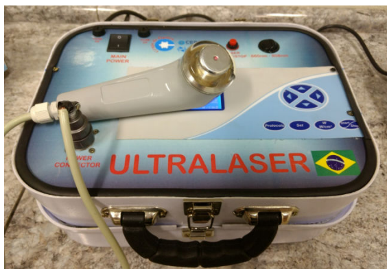
Figure 1. Laser and ultrasound in the same hand piece (prototype).

A prototype was developed (Figure 1) at the Technological Support Laboratory at IFSC - USP. This system includes a laser beam at the center of the ultrasound transducer so that the therapies can be carried out or applied simultaneously. The ultrasound can be operated at 1 or 3 MHz frequency and in a continuous or pulsed mode. The laser has a power output of 100 mW and red (660 nm) or infrared (808 nm) wavelength.