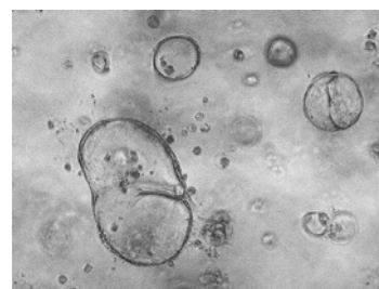
Figure 3: Cysts formed in 3-D culture by the PCK cholangiocytes The PCK cholangiocytes form cystic structures in Matrigel matrix.

Somatostatin and its analogue, such as octreotide and pasireotide, have been shown to inhibit elevated cAMP levels and to decrease fluid