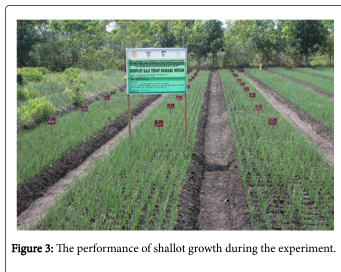
Figure 3: The performance of shallot growth during the experiment.