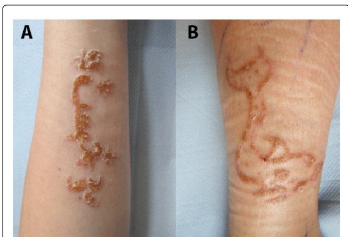
Figure 2: Appearance of patient's left volar forearm (a) and left lateral leg (b) 15 days after application of the black henna tattoo.

Numerous similar cases of allergic contact dermatitis to PPD have been reported in the literature [2,3,7,9]. The spectrum of the adverse consequences ranges from mild eczema to more severe bullous reactions with permanent scarring, and in some instances, keloid scar formation. Rarely, acute life threatening Type I immediate hypersensitivity reactions have also been described [10].