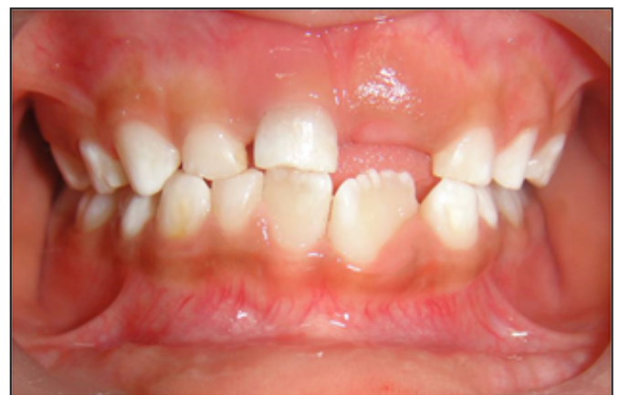
Figure 1. Front view showing large left mandibular central incisor.

An intraoral periapical ( Figure 4 ) and mandibular occlusal radiographs ( Figure 5 ) were taken which revealed fusion of teeth on the coronal aspect, and two separate roots in close apposition with each other. Both the radiographs revealed the fusion of crowns of the two teeth with two pulp chambers, two root canals with open apex and inverted "V" shaped