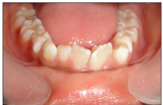
Figure 2. Front view showing fused left mandibular teeth with lingual talon cusp.