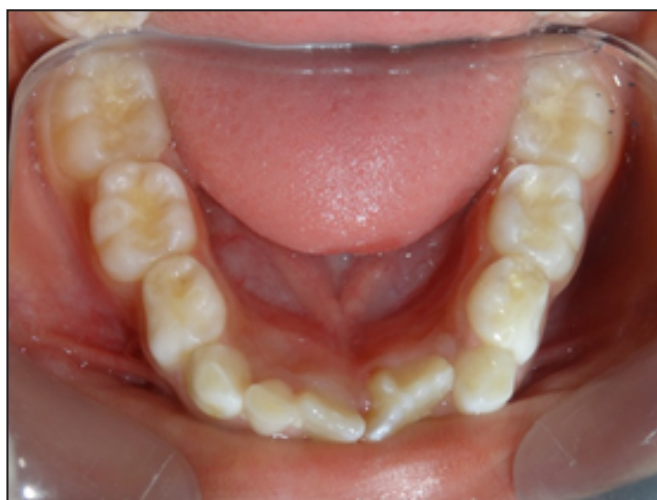
Figure 3. Occlusal view of Talon's cusp on fused left mandibular teeth.