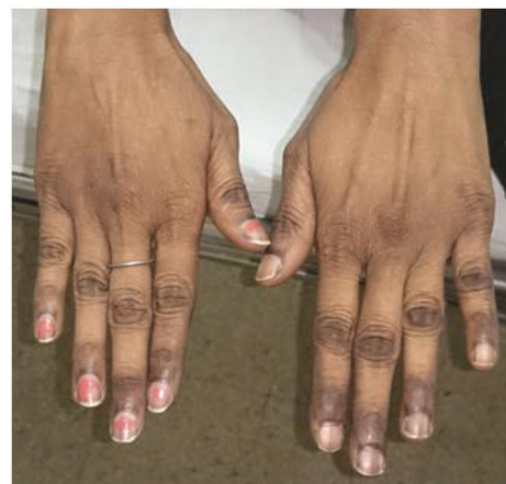
Figure 1: Darkening of knuckles.

of ectopic ACTH production from MTC patient underwent total thyroidectomy with central and left modified lateral neck dissection. As left lobe was extending into the posterior mediastinum below the arch of aorta, sternotomy was performed for tumour resection. In postoperative period, patient received stress doses of corticosteroids in view of suppressed Hypothalamic Pituitary Adrenal axis (HPA). Final histopathology was MTC which was positive for calcitonin and ACTH on immunohistochemistry (Figure 3), confirming diagnosis of ectopic ACTH secretion. After three months follow up, there was partial resolution of skin hyperpigmentation, she was cured of diarrhea and menstrual irregularity. Proximal myopathy had improved though HPA was still suppressed and she was still on replacement doses of steroid. ACTH value is <5 pg/ml with drop in serum calcitonin value to 4010 pg/ml/. In literature, 30% to 80% of the patients' inspite of curative surgery still show Persistent hypercalcitonemia and advanced tumor stage is one of the key factor [5,7].