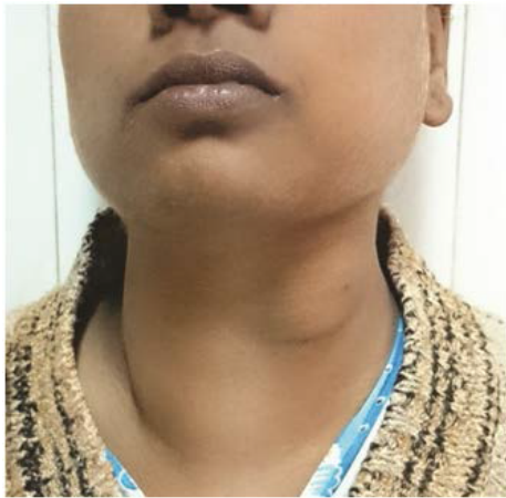
Figure 2: Goiter.