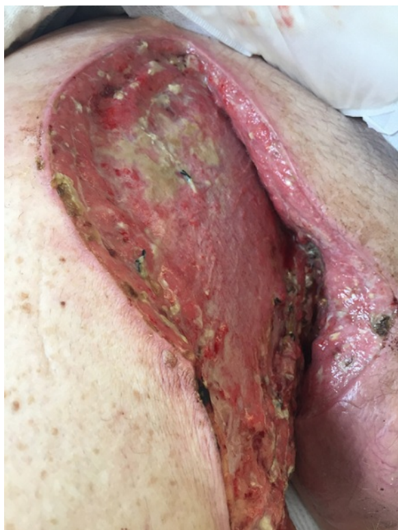
Figure 2: Debrided wound of the right groin.

The remainder of his hospital course consisted of complex wound care (Figure 2) with intermittent debridements, continuation of Foley catheter bladder drainage, and increasing physical therapy. All blood, urine, and tissue cultures remained negative for microbes throughout his stay. Urine output improved significantly, with greater than one liter of urine output per day. Although amylase levels were not evaluated on his tissue biopsies, the presumed diagnosis in this patient