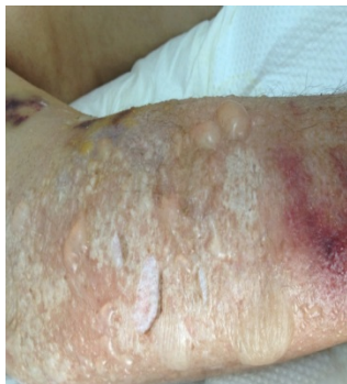
Figure 2: Demarcated skin necrosis and bullous skin lesions