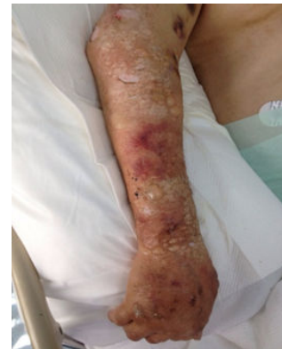
Figure 1: Demarcated skin necrosis and bullous skin lesions

necrosis and bullous skin lesions occurred in the patient's right hand and forearm (Figures 1 and 2). After immediately discontinuing the infusion we secured an alternative venous access. In consultation with a dermatologist we started our treatment plan with sterile dressings of 2% lead sub acetate (Goulard's extract) solution 4 times a day and 20 minutes long each time, systemic glucocorticoid therapy and topical and systemic antibiotherapy. Our treatment strategy resulted in delayed complete healing which took almost 3 weeks (Figure 3).