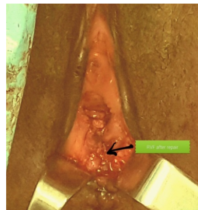
Figure2: RVF after repair.

After two weeks stay in the hospital, she was evaluated and found to be fit for surgery. Patient was put on flood diet for 24 hours followed by an overnight fasting for 8 hours. Circumscribing incision made around fistula edge, vaginal mucosa mobilized from the rectum, fistula edge trimmed and closed in two layers with vicryl # 2-0 (Figure 2). Postoperatively the patient was continent to feces and flatus and discharged on sixth postoperative day with appointment. When client came Six weeks later for evaluation, the fistula healed and she was continent to both feces and flatus. The couple had already started sexual intercourse after the fourth postoperative week and reported no discomfort.