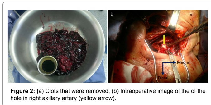
Figure 2: (a) Clots that were removed; (b) Intraoperative image of the hole in right axillary artery (yellow arrow).