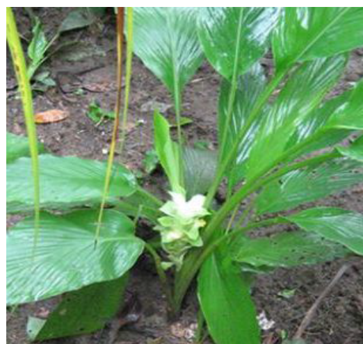
Figure 2a: Curcuma longa plant.

Phytochemical screening of the dye confirmed the presence of saponins, tannins, flavonoids and alkaloids. Among these compounds,