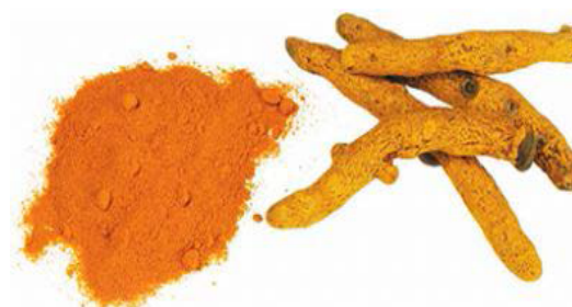
Figure 2b: Curcuma longa rhizome powder.