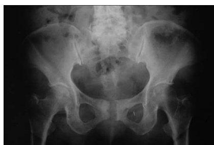
Figure 4 Anteroposterior plain radiograph of the pelvis at the 5-years follow-up observation showed no further erosion of bone.