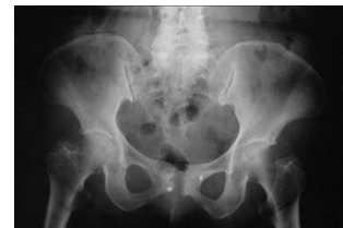
Figure 1: Anteroposterior plain radiograph of the pubis demonstrated 2 bone screws in place, bone sclerosis and irregularity of the margins of the pubic bone.

were performed, and the samples were sent for culture and pathological analysis. The bone anchors and the attached suture material were removed. The necrotic bone was curetted to sound bleeding bone with care not to destroy the ligamentous complex. Soft tissue debridement