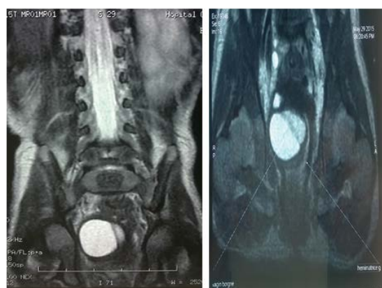
Figure 1: Magnetic resonance image showing hyperintense fluid collection in the right uterine cavity.

OHVIRA is a rare congenital anomaly constituting 10% of all Mullerian duct abnormalities. The incidence of uterus didelphys, related to OHVIRA, is approximately 1/ 2000 to 1/ 28000, and it is accompanied by unilateral renal agenesis in 43% of cases [2]. The pathogenesis of OHVIRA syndrome has been related to embryologic arrest during 8 th week of gestation that ultimately affects the Mullerian and metanephric ducts [3]. Generally, the paramesonephric ducts appear at 44-48 days of gestation as longitudinal invaginations of the surface epithelium along the mesonephric ridge lateral to mesonephric ducts [4]. An early failure of the metanephric diverticulum to develop