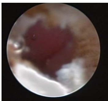
Figure 3: The right wall of the vagina after section.

(at 5 weeks) from the mesonephric duct results in agenesis of the ureteric bud, which leads to agenesis of the ipsilateral ureter and kidney [5].