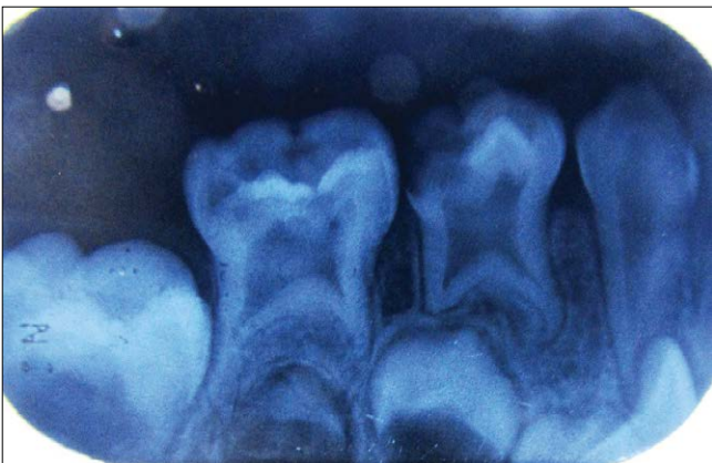
Figure 2. Intraoral Periapical radiograph in relation to 84, 85.