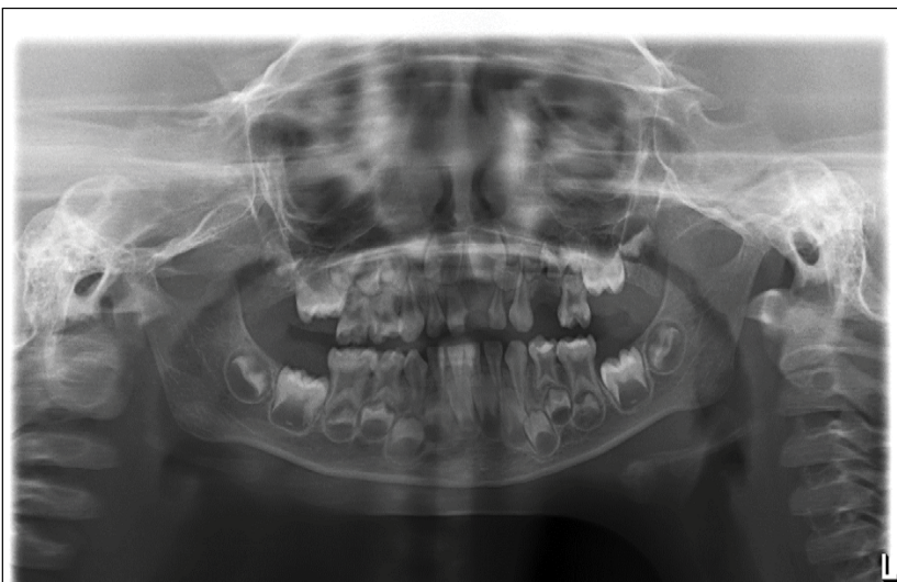
Figure 3. OPG of the patient.