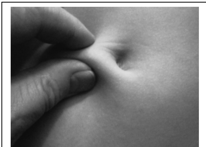
Figure 2: Photograph showing the nipping test for allodynia in the cutis/subcutis near the navel.

The nipping test is a standardized easy examination, for which no equipment is needed, to test for of allodynia in the cutis and sub cutis, a sign of sensitization. This test can be executed in less than a minute in the clinic practice. A low level of pressure, which would not normally elicit pain, is applied by nipping a layer of a small area of the cutis/subcutis between the thumb and index finger, with nails cut short; see Figure 2. The nipping test has been validated for recurrent psychosomatic abdominal pain [4]. The subcutis is easily distinguished from the underlying muscles by the muscle fascia. The pressure applied is calibrated to be not higher than approximately 125 kPa/cm 2 by using an algometer; a pressure below the normal pain threshold [9]. A pressure below pain threshold to be applied on the Nipple test can be found in a more practical way, but less scientific, by nipping a person without pain problems, i.e. the physician him/herself.