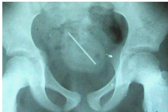
Figure 3: X-ray showing same needle migrated from thigh into the bladder.

Fifth case was a 36 year old woman who was referred for intermittent left flank pain and her USG was suggestive of Left hydronephrosis and hydroureter up to distal ureter along with an IUCD in bladder which was fixed at vesicouterine junction (VUJ).