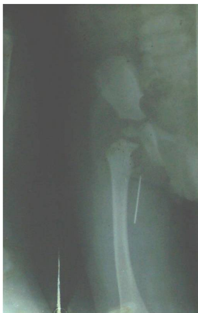
Figure 1: Previous X-ray of case-1, showing needle in thigh.

Fourth case was a male of 32 years, who had few episodes of painless terminal haematuria since last 3-4 weeks. He had history of fire arm injury in lower abdomen and a bullet was lodged in right groin which was could not be located during primary exploration. Serial X-rays were consistent with the presence of bullet in pelvic cavity. Fresh x ray KUB obtained and this time bullet was seen to migrate to the suprapubic region. Cystoscopy confirmed presence of encrusted bullet in bladder which was removed by cystolithotomy.