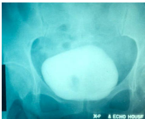
Figure 4: showing intravesicle migrated guagepiece as space occupying lesion.

In sixth case, there was recurrent pyuria, dysuria and few episodes of terminal haematuria for six months in a 33 year old female. She had h/o Manchester repair 4 years back for uterine prolapse. USG was suggestive of heterogeneous mass in the trigonal area of bladder while cystogram of IVU series suggested filling defect in bladder (Figure 4). But on cystoscopy, it was actually a piece of gauze with surrounding sloughed ulcer in trigonal area. Foreign body was removed cystoscopically and the recovery was uneventful.