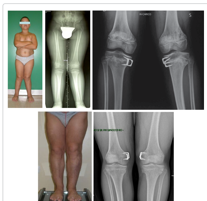
Figure 2: Case 2 2 A: Age 11.5 yrs, boy, height 126 cm, weight 35 Kg, genu valgum in SDS. The intermalleolar distance was 13 cm. 2 B: Preoperative full length standing A.P. radiograph shows a valgus knee deformity of 18° with metaphyseal dysplasia prevalent in the proximal tibia. 2 C: 18 months after medial tibial hemiepiphysestomy with staples, the X-ray shows the persistence of valgus deformity of the femoral axis and an overcorrection of the tibia. At that time the intermalleolar distance was 8 cm. 2 D: Age 15.9 yrs, height 150 cm, weight 52 Kg. Clinical features with the knees aligned properly before removing the staples from the femur. 2 E: Full length standing A.P. radiograph shows framework stabilized.

Skeletal changes are present in all patients examined in a study by Makitie et al. [4] and the presence or absence of abnormalities in a specific region of the skeleton appears to be dependent on the age of the patient [4].