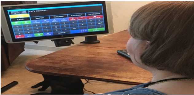
Figure 1: Eyegaze edge.

has a camera mounted below its screen that tracks the user's eye movement and helps the user communicate with the device using their eyes (Figure 1).