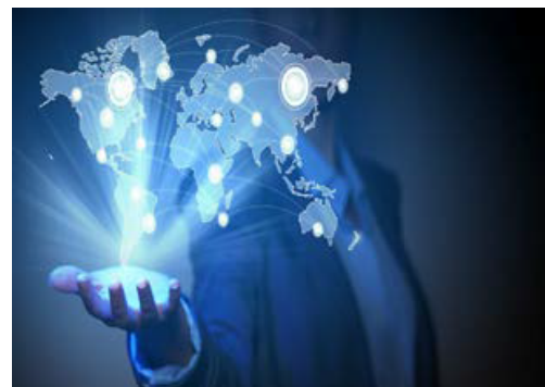
Figure 3: Forex brokers across the internet.

It has been rated as the best broker offering remarkable services