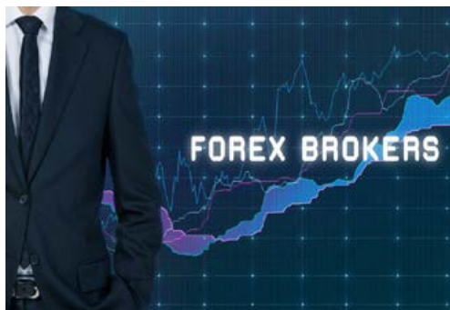
Figure 1: Forex brokers.

One of the most important factors you need to consider when choosing a broker is regulation. You should always select brokers that