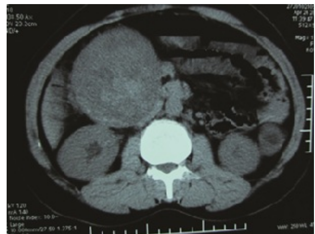
Figure 1: Plain CT scan of the abdomen showing a well-defined space occupying mass lesion in the sub hepatic region, in direct relation to the inferior aspect of the head of the pancreas.

A 32-year-old woman presented with vague upper abdominal pain for three months. On examination there was a nontender mass in the periumbilical region. Computed tomography scan revealed a well-defined mass lesion in the subhepatic region, in direct relation to the inferior surface of the head of the pancreas, and measured 8.0x7.0 x 6.0 cm (Figure 1).