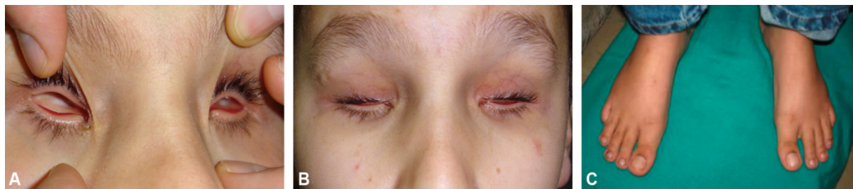
Figure 2: Pictures of the affected child. A: The 14-year-old boy affected with bilateral anophthalmia. B: Note the absence of eye when the upper palpebral lid is reversed. C: Feet with arachnodactyly.

Indeed, the unaffected father was carrying the [c.422delA] variant in exon 2 (Figure 3C) while his mother was normal (Figure 3B), suggesting the presence of a deletion that included at least exon 2. No mutations were detected in the patient's siblings. The VSX2 c.422delA mutation was not detected in 96 controls from North Africa nor in 96 Swiss controls. Mutation screen of all other A/M genes did not reveal any other anomaly or mutation.