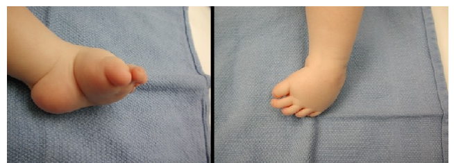
Figure 1: Congenital club foot.

per 1000 births [12], while the incidence of CMT is reported as 0.017% to 1.9% in infants [10].