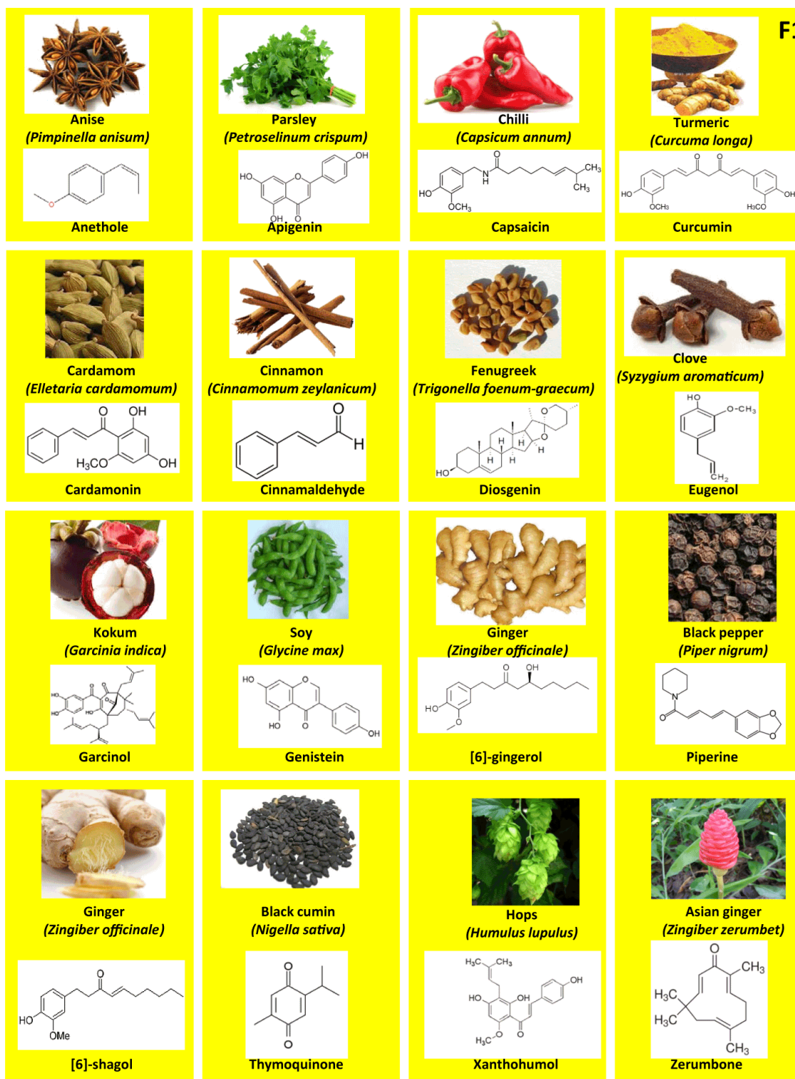
Figure 1: Anti-inflammatory spices and their bioactive molecules.

inflammatory products have shown to be regulated by the nuclear transcription factor NF- \kappa B, which is considered the master molecule of inflammation.