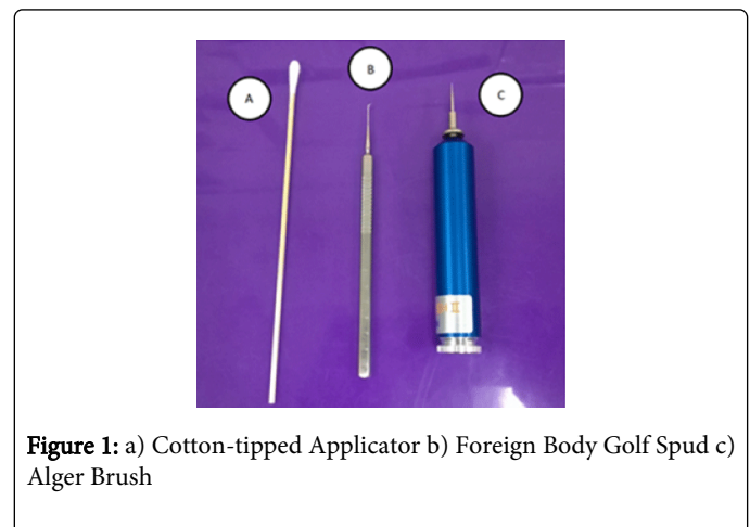
Figure 1: a) Cotton-tipped Applicator b) Foreign Body Golf Spud c) Alger Brush

Following diagnosis, we debrided the left eye corneal epithelium. The patient was administered 2 gtt's 0.5% proparacaine and the epithelium was debrided through the slit lamp biomicroscope using a cotton-tip applicator (Figure 1).