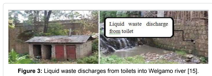
Figure 3: Liquid waste discharges from toilets into Welgamo river [15].