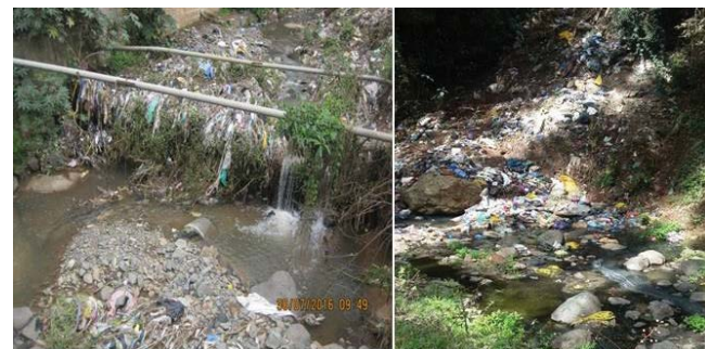
Figure 4: Solid waste from residents houses, which is dumped into Welgamo river [15].

Welgamo River rises from the north east high lands of Addis Ababa, and flow to the downstream of Yeka sub-city, and ultimately enters into Akaki Rivers. Residential house practices such as drinking, washing, swimming and irrigation are the main sources for the pollution of Welgamo River [15]. The people, who lived around Welgamo River, is directly discharge their liquid from toilets and solid waste from their houses in to the river (Figures 1 and 2). According to Berihun et al. (Figures 3 and 4) [15], the water quality parameters of values of welgamo river in the downstream area are 6.84, 313 μS to 561 μS, 156 mg/L to 282 mg/L (during dry season), 1.2 mg/L, 7 mg/L to 72 mg/L (during rainy season), and 60 mg/L (due to human and animal urine), for pH, electrical conductivity (EC). Total dissolved solids (TDS), phosphate,