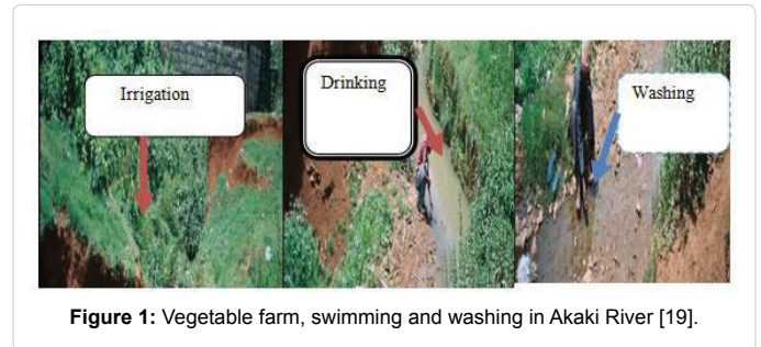
Figure 1: Vegetable farm, swimming and washing in Akaki River [19].

high waste water pollution in the cities compared to the rural areas of Ethiopia [22]. For example, from Addis Ababa city, 4 million m 3 wastewater is emanated from industries discharge, and 49 million m 3 from toilets, kitchens, barns and other domestic area [6] ditches and water bodies, and the remaining 65% of production of solid wastes per day is collected and disposed in to Repi dump site and became a serious threat to the environment [6]. The main sources of solid waste, which is generated from in and around Addis Ababa city includes: households (76%), institutions, commercial, factories, and hotels (18%), and street sweeps (6%) [20]. Liquid wastes are the second main source of river pollution in and around Addis Ababa city, and these l wastes are drained to the side of roads and join small streams and rivers, and ultimately flow to downstream causing water pollution. Because there is a huge amount of household sewages (liquid dung, domestic wastewater, etc.) in the urban areas such as Addis Ababa city, it is not uncommon to expect high waste water pollution in the cities compared to the rural areas of Ethiopia [22]. For example, from Addis Ababa city, 4 million m 3 wastewater is emanated from industries discharge, and 49 million m 3 from toilets, kitchens, barns and other domestic area [6].