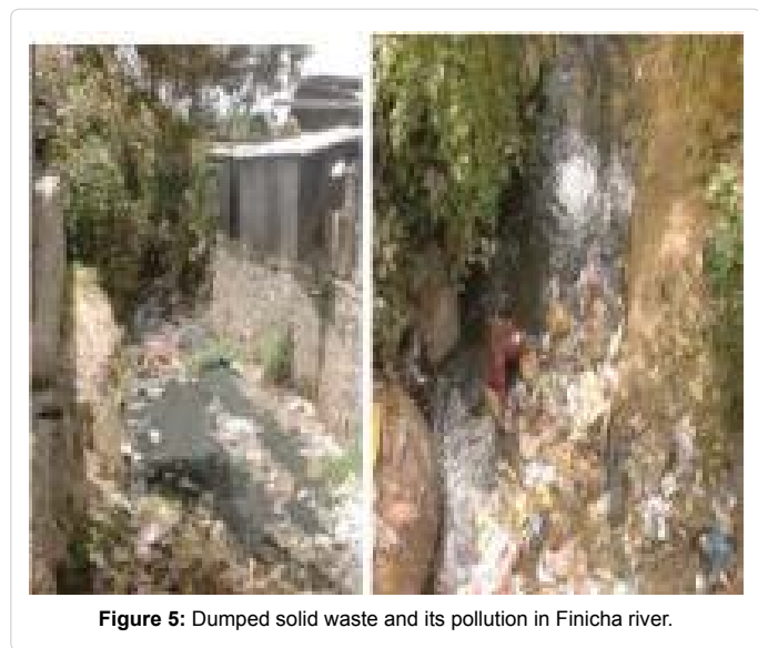
Figure 5: Dumped solid waste and its pollution in Finicha river.

Aba-Samuel lake reservoir is located at south west of Addis Ababa city and it covers an area of 11,454 km 2 [37]. Both Big and Little Akaki Rivers, and their tributaries are discharging (after 53 km flow) into the Aba-Samuel reservoir [38-40], and unfortunately these rivers and their tributaries are serving as a natural sewer line for domestic, agricultural chemicals and industrial wastes [39]. Both Akaki Rivers and small tributaries, which are not directly drain or link with Big and Little Akaki Rivers, are flowing and entering into Aba-Samuel artificial reservoir with their pollutant loads [38]. Because majority of the people, who are living around the Aba-Samuel Lake, use the water of the lake for their daily domestic purposes, it contributed to the pollution of the lake. From the total households, which are resident around Aba-Samuel dam, 70% of them are using the water of the reservoir for bathing/washing and about 93% of their animals depend on the lake. Moreover 40% of the lake and river water are in use for drinking/cooking purpose. Furthermore, the perception study regarding the community health problems, shows that 31.5%, 60.3%, 4.8% and 3.4% of the health problems of the society, who are living around the reservoir, are due to water pollution, water hyacinth related cases, sanitary problems and other cases, respectively (Figure 6).