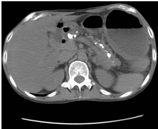
Figure 2: CT scan of abdomen showing calcification within the pancreatic parenchyma and dilatation of duct with calcification within the pancreatic duct. White arrow denoting calcification within the pancreatic duct resulting into its dilatation.

The Patient was counseled about the condition and started on oral pancreatic enzyme supplements. He gradually improved with symptomatic treatment, with increased appetite and weight gain. On follow up for two years, patient is asymptomatic with no signs of disease elsewhere in the body. He currently does not require pancreatic enzyme supplements.