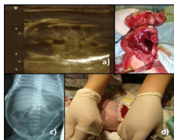
Figure 2: a) Adrenal gland haemorrhage b) Gastroschisis, small bowel surface tearing c) (artificial) Gastric perforation d) Gastroschisis, perumbilical bleeding postoperative.

According to Papanaglotou [2], birth trauma alone is responsible for less than 2 % of all neonatal deaths, after mortality caused by birth trauma dropped by 88 % in the 1970s and mid 1980s due to the technical progress made in obstetrics at that time. Namely, by identification of high risk deliveries by fetal and perinatal ultrasound prior to labour, the use of less harmful obstetrical instruments and techniques and last but not least Cesarean sections becoming more and more accepted.