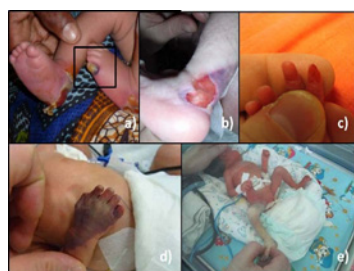
Figure 3: a) Caustic soft tissue lesions both heels (inlay: hair-thread-toe-tourniquet-syndrome) b) (sodium bicarbonate) paravasate left ankle c) (pressure-induced) subtotal pulp amputation left little finger d) Vascular catastrophe hand and elbow vascular catastrophe -arterial embolism-lower extremity.

If signs of trauma like “cerebral damage” or “cerebral disturbance” have been present after birth, hypoxia during birth or birth asphyxia has mostly likely been the cause. Quite often this asphyxia is the result of prolonged labour, midforceps or breech delivery in full term infants, abruption placenta, maternal sedation in premature infants or unattended precipitate deliveries in immature infants, but not exclusively. However, hypoxia during birth or birth asphyxia is usually not recognized as a birth injury per se [1,2,8,9].