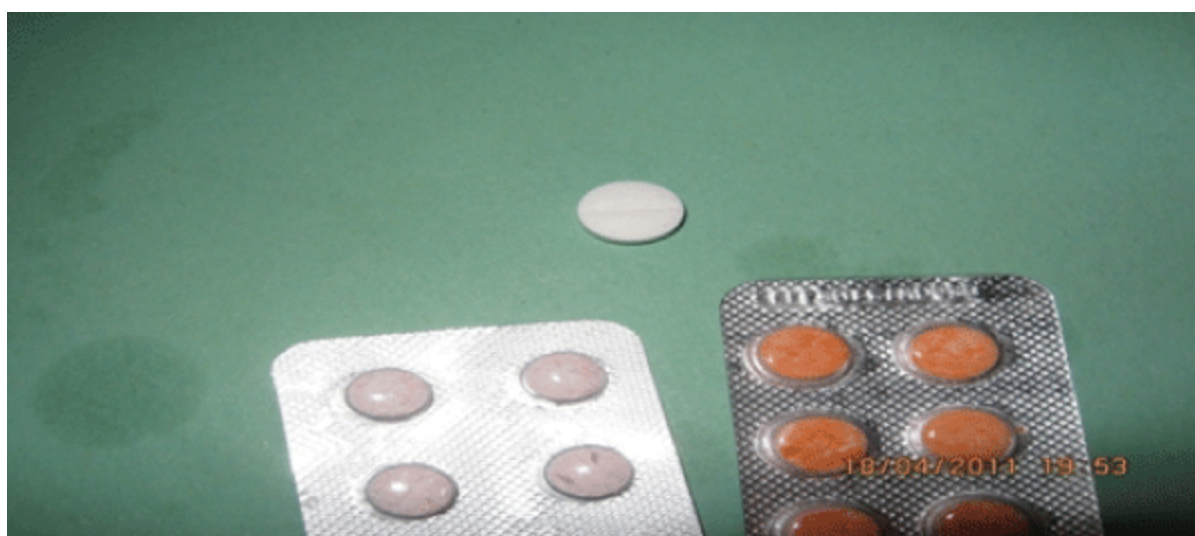
Figure 2: Some brands of 75mg aspirin tablet in sachet and a 300mg aspirin tablet (white)

In summary, this paper argues that the scientific/ethical grounds that can justify the almost universal use of aspirin in type 2 diabetes and/or hypertension especially as primary prevention for atherosclerotic disorders as recommended by local experts is yet to emerge. This calls for greater restriction of baby aspirin availability at all tiers of care with closer monitoring of its use to minimize misuse/abuse. Moreover, making the 300 mg aspirin tablet formulation as available as the 75 mg tablet formulation could give prescribers and consumers greater choice in lowering treatment cost for individuals requiring low dose aspirin therapy especially for secondary prevention in those with known occlusive atherosclerotic disease, but are unable to pay the higher cost of using the 75 mg tablet formulation that comes with more convenient packaging (Figure 2).