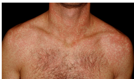
Figure 2: Maculopapular rash in a patient with infectious mononucleosis following amoxicillin intake.

69%. Chovel-Sella et al. found the aminopenicillin rash in children is significantly lower than the 90% incidence rate reported in earlier studies [1,3,6,7]. The skin eruptions are mostly diffuse, symmetric maculopapular exanthems on the whole body (Figure 2). Not only morbilliform lesions, but in some cases urticarial, purpuric and vesicular rashes, pustular erythematous rash, universal erythema or cutaneous vasculitis in the erythema multiforme pattern were also reported in connection with antibiotic use [16,17,20,27]. Severe cutaneous reactions such as erythema multiforme or Stevens-Johnson syndrome may be possible manifestations [28,29]. Although these cases are well-documented clinically, skin biopsies are rarely taken, and histology reports are exceedingly rare. Because the clinical picture of drug induced skin eruptions appear similar, differentiation by histopathologic examination could be helpful [30]. We took skin biopsies and performed histologic examinations among our patients who developed maculopapular rash following amoxicillin intake in IM (Figure 2). The following histopathologic changes were prominent: hydropic degeneration of basal keratinocytes; mononuclear cells around the vessels and a few eosinophil cells (Figure 3). Sign of leukocytoclasia also appeared in some cases. Both the clinical and histological features confirm a delayed type hypersensitivity reaction [8].