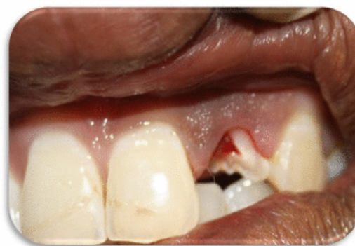
Figure 2. After fragment removal.