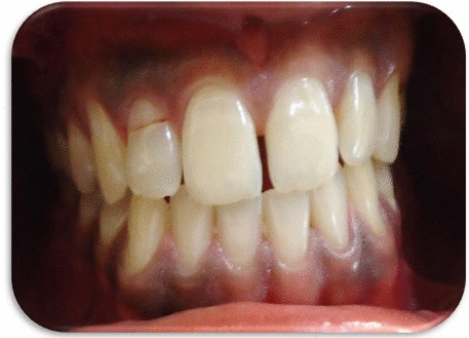
Figure 9. Pre-operative clinical picture.

As there was a perfect approximation of the fractured fragment there was no need for the elevation of the flap. Then the desired length fiber post (Dentply Tulsa, Johnson city, US) was luted with dual cure resin composite (Ivoclar Vivadent) after etching with 37% phosphoric acid (Ivoclar Vivadent) and bonding agent applicaton (Prime & Bond NT, fifth generation) (Figure 15).