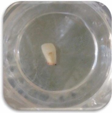
Figure 12. After fragment removal.