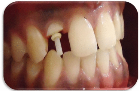
Figure 15. Fiber post cementation.

Function, aesthetics and biologic restoration of fractured incisor often presents a de-vasting clinical challenge. Development of adhesive material creates new perspectives in reconstruction of fracture teeth. Re-attachment of the fractured fragment would be an alternate treatment option whenever fracture segment is available [7].