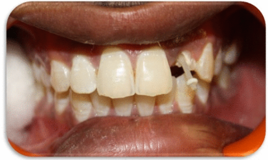
Figure 5. Clinical picture of post cementation.