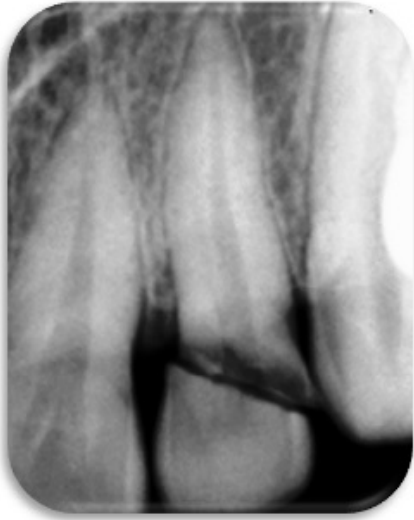
Figure 3. Pre-operative radiograph.