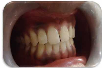
Figure 17. After one year follow up.

In literature based on the location of fracture line, there are various treatment modalities, which include orthodontic extrusion and surgical extrusion when the fracture line is below the crest of bone [8-9], placing a chamfer at the fracture line, using V-shaped enamel notch, placing an internal groove when the fracture line is above the crest of bone height and above marginal gingiva [9].