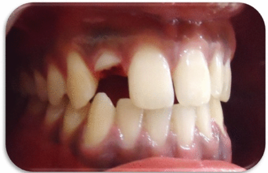
Figure 10. After fragment removal.