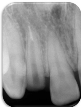
Figure 14. Post space preparation.