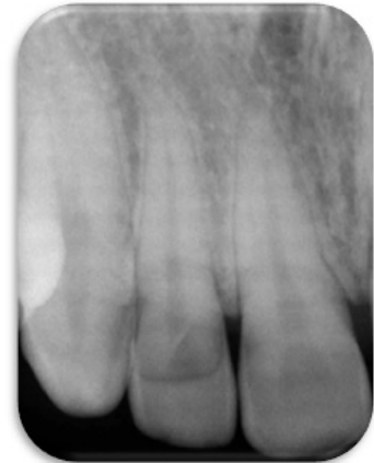
Figure 11. Pre-operative radiograph.

The inner portion of the coronal fragment was similarly etched and bonded to the tooth using flowable composite resin (Ivoclar Vivadent) after proper shade matching (Figure 16). Finishing and polishing was performed for the teeth and the patient was kept on recall after one month, three months and one year (Figure 17). The restored teeth were found to be in good condition, both esthetically and functionally.