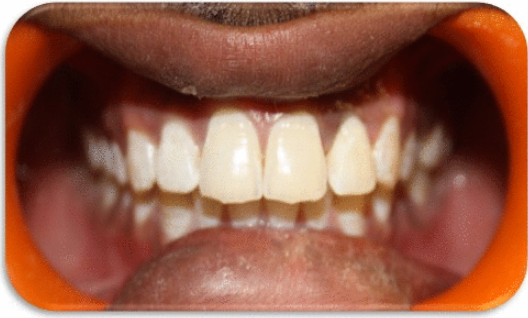
Figure 7. After fragment reattachment.