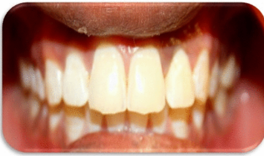
Figure 8. After one year follow up.