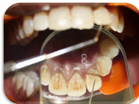
Figure 1. Pre-operative clinical picture wrt 22.

fracture in the cervical third region of the left maxillary incisor involving enamel and dentin with exposure of the pulp and the fractured fragment was loosely attached to the tooth (Figure 2,3). A detailed explanation about the treatment plan was given to the patient, which included endodontic treatment, then reattachment of the tooth fragment using a fiber post and the treatment plan was accepted by the patient.