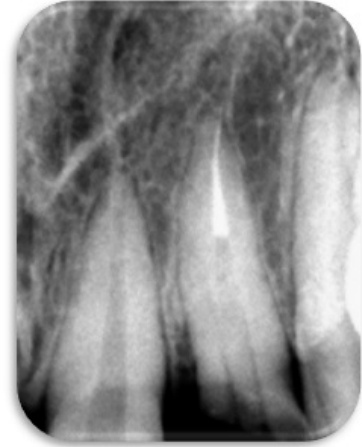
Figure 4. Post space preparation.