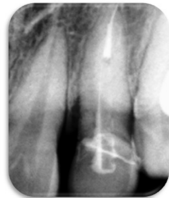
Figure 6. Fiber post cementation.