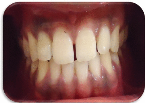
Figure 16. After fragment re-attachment.