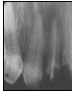
Figure 5. Radiographic image of 22, 6 months after MTA treatment

with sodium hypochlorite 2.5% and then we placed calcium hydroxide in the canal for a week ( Figure 7 ). A new radiological exam was indicated. At the next appointment the calcium hydroxide was removed with H 2 O 2 , and placed again in the canals, then we placed MTA on the pulp chamber floor and then a moisture cotton ball in the pulp chamber. After 4 hours we checked if the MTA set and we placed a temporary filling. The third appointment: radiographic evaluation after 1 month showed an important improvement of the periradicular lesion ( Figure 8 ). The next radiographic evaluation at 6 months showed almost complete healing of the periradicular bone ( Figure 9 ).