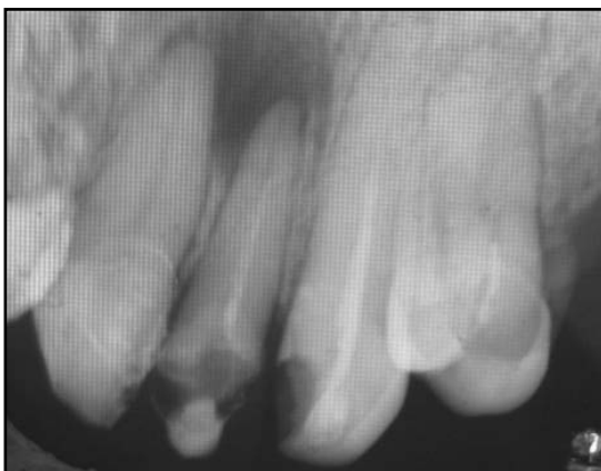
Figure 2. Incomplete root canal filling and periapical lesion in 22

Patients were evaluated with radiographs at the first appointment, at 3 and 6 months after MTA was placed into the canal.