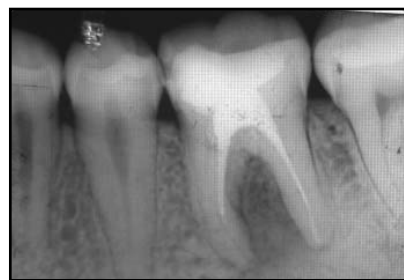
Figure 8. Important decrease of furcal radiolucency in 36 after one month with MTA treatment

with sodium hypochlorite 2.5% and then we placed calcium hydroxide in the canal for a week ( Figure 7 ). A new radiological exam was indicated. At the next appointment the calcium hydroxide was removed with H 2 O 2 , and placed again in the canals, then we placed MTA on the pulp chamber floor and then a moisture cotton ball in the pulp chamber. After 4 hours we checked if the MTA set and we placed a temporary filling. The third appointment: radiographic evaluation after 1 month showed an important improvement of the periradicular lesion ( Figure 8 ). The next radiographic evaluation at 6 months showed almost complete healing of the periradicular bone ( Figure 9 ).