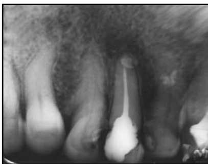
Figure 14. Radiographic image of 13 one month after MTA treatment evidences beginning of bone deposition