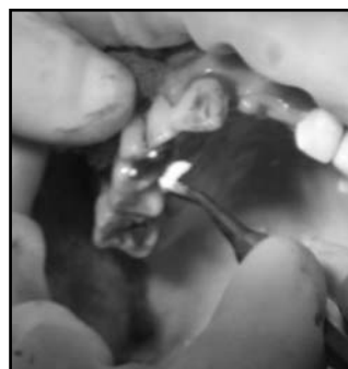
Figure 13. Inserting MTA in the apical cavity