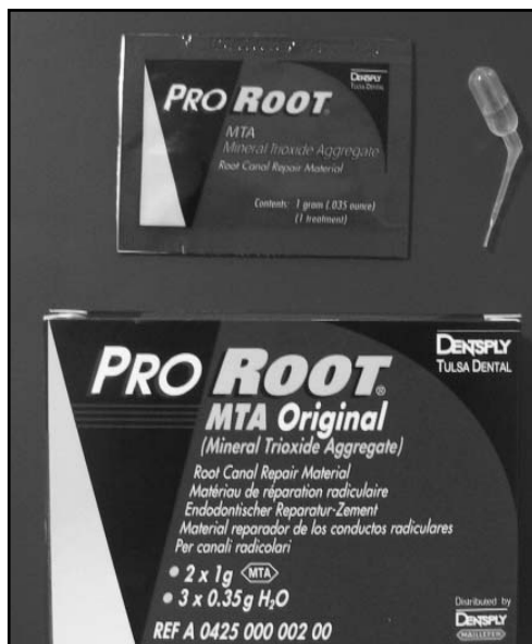
Figure 1. PRO ROOT MTA (DENTSPLY DE TREY)

We chose to use PROROOT MTA (DENTSPLY DE TREY), ( Figure 1 ) observing the producer's indication. In all cases the canals were prepared and then sterilized with calcium hydroxide for a week. At the second appointment we placed MTA in the apical section of the canal system and, if the case permitted, we obturated the radicular canal.