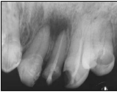
Figure 4. Radiographic image of 22, 3 months after MTA treatment