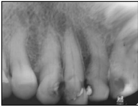
Figure 10. Chronic apical periodontitis in 13

obtured with MTA during surgery. The initial radiographic image manifested a periapical radiotranslucency in 13 in relation with the periradicular space; the first step of the surgical intervention consisted in lifting a mucoperiosteal flap ( Figure 11 ), root resection and granulation-tissue curettage ( Figure 12 ), placement of MTA ( Figure 13 ) and then flap suture. The radiological evaluation at one month showed bone deposition in the apical region ( Figure 14 ), and at 3 months complete bone healing and no clinical symptoms ( Figure 15 ).