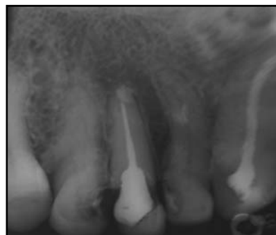
Figure 15. 13 at 3 months after MTA treatment displaying apical bone healing