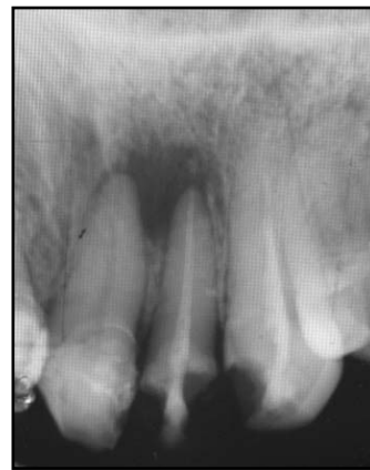
Figure 3. Radiographic image of 22 one month after MTA treatment

At first the anesthesia was performed, the phlegmon was opened and drained with antiseptics. General oral treatment was indicated with antibiotics and analgetics. At the second appointment we continued the mechanic canal treatment, used antiseptics lavages with sodium hypochlorite 2.5% and then we placed calcium hydroxide in the canal for a week. At the next appointment the calcium hydroxide was removed with H 2 O 2 , and in the moisturized canals we placed MTA with Lentullo, and we placed a moisture cotton ball in the pulp chamber. After 4 hours we checked if the MTA set and we placed a temporary filling. The evolution of the periapical lesion was radiographically assessed at 1 month ( Figure 3 ), 3 months ( Figure 4 ) and 6 months ( Figure 5 ). After 6 months with MTA treatment there was an important improvement of the periapical lesion.