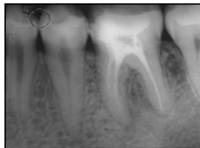
Figure 9. Almost complete healing in the furcal area of 36 after 6 months with MTA treatment