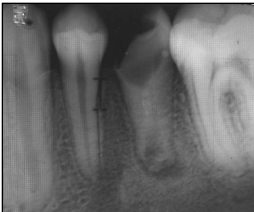
Figure 17. Radiographic image of 35, 6 months after MTA treatment, manifesting a closed apex