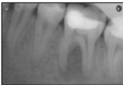
Figure 6. Furcal radiolucency in 36

Based on the radiographic aspect and the clinical exam we established the diagnosis of chronic periradicular periodontitis. The treatment consisted in removing the filling and opening the pulp chamber, debridation of the canal system, antiseptics lavages