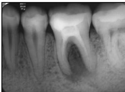
Figure 7. 36 with calcium hydroxide after one week