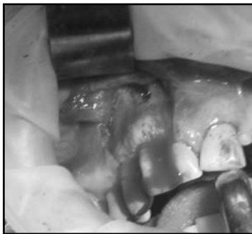
Figure 12. Root-end resection and granulation tissue curettage