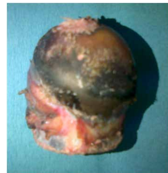
Figure 2: Blackpigmentedfemoral head

After the surgery we start the rehabilitation. As usual patient rise on the second day after surgery with canes and stair, climbing in the 4 th day.