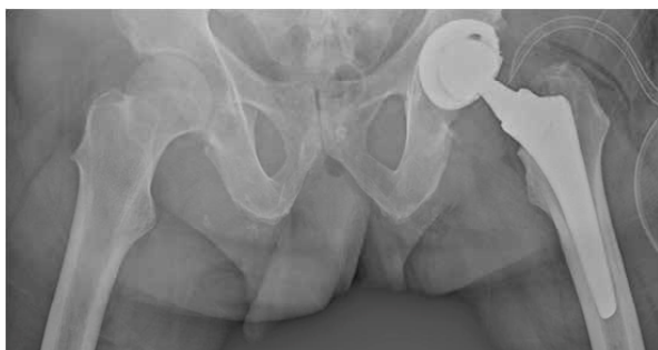
Figure 3: Postoperative check

We have evaluated after 6 months of the surgery with functional and quality of life scores. We obtained the some results with no AKU patients. The AKU damage is limited and the bone is still good so cementless implants are good. Analyzing the sf36 scores we have the