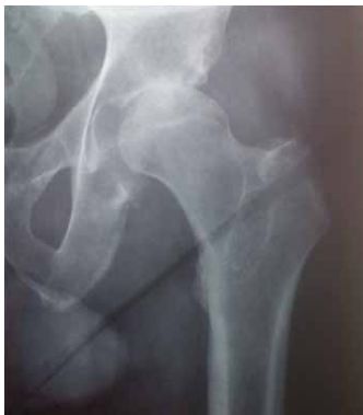
Figure 1: 1Preoperativeimage

The fragility of the cartilage of AKU patients leads to fragmentation of its upper layer, causing the detachment of small fragments (shards) with consequent exposure of the subchondral bone. For this reason patients suffer joints pain and quickly involved in a multiple joints replacement [1]. Our patient already was treated with multiple joint replacements, both shoulders were treated with an inverse arthroplasty, and now is presenting hip pain as frequently viewed in AKU patients [4]. In literature [5] there are many articles with different treatments of ochronosis with cement or cementless devices [6,7]. In AKU the lesions are limited to the cartilage and nothing append to the cancellous bone. Considering the age of the patient (55 years old) cement less modular stem and cement less cup for us is the best choice.