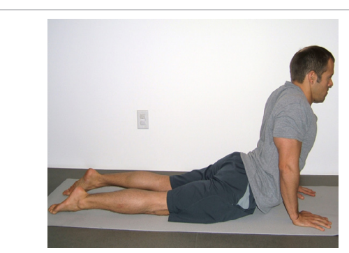
Figures 2: cobrapose.