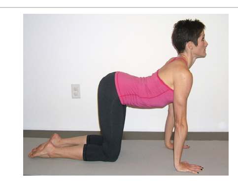
Figures 1: cow pose.

region should be avoided. In the absence of any contraindications and utilizing the proper cautions in patients with spine pain, it is evident that properly performed yoga postures are helpful in diminishing