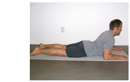
Figure 4: Sphinx pose.