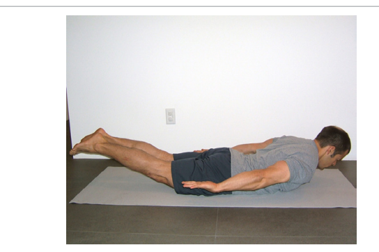
Figure 5: Locust Pose.

pain, improving function, and reducing stress and anxiety in patients with chronic back and neck pain. As with many treatment modalities, better controlled randomized controlled studies are needed to further evaluate the role of yoga in managing chronic back and neck pain.