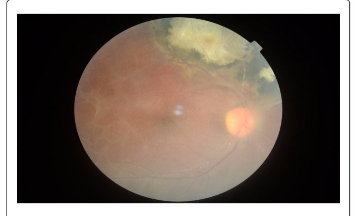
Figure 1: A large peripheral lesion of a 26 year old patient; Size of lesion>2DD; presence of vitreous strands; VA=6/12.

Low vision of VA worse than 6/18 occurred in 22 (66.7%) eyes, out of which 11 occurred at the macular, 5 juxtamacular and 6 juxtapapillary. Multiple (two or more) scars occurred in 10(30.3%) eyes; the other 23(69.7) eyes had single lesions. However, there was no association between cause of visual impairment and the number of lesions occurring in the infected eyes ( \chi^2 =3.52, p=0.11). Table 2 gives the relationship between characteristics of Toxoplasma ocular lesions and low vision/blindness in the infected eyes where bigger and posterior pole lesions were significantly associated with the causes of low vision and blindness in the infected eyes. Figures 1-3 represent fundus photographs of some of the patients.