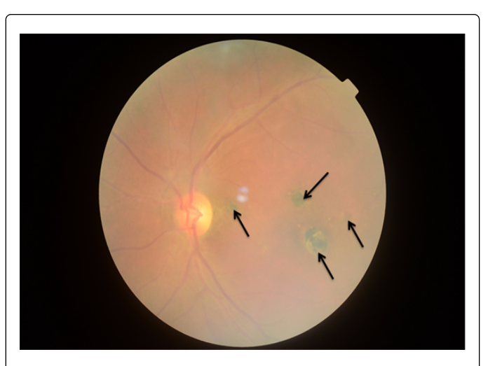
Figure 2: Multiple posterior pole lesions of a 50 year old patient; Size of lesion<1DD; VA=6/36.

Elder patients had larger retinochoroidal lesions: mean age of patients (43.7 \pm 13 years) with lesions \geq 2DD was significantly higher than the mean age of patients (27.1 \pm 10 years) with smaller lesions <2DD F=14.2, p=0.001]. Similarly, multiple lesions occurred significantly (F=13.4, p=0.001) in elder patients (mean age of 47.4 \pm 11 years) than in younger patients (mean age of 29.4 \pm 12 years).