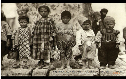
Figure 3: Serious and mature-looking Anatolian peasant-children in 1924 (From the published archives of National Geographic).