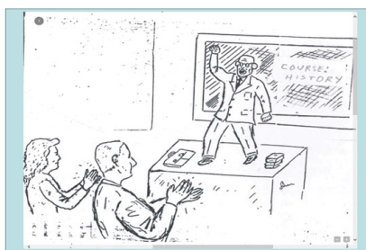
Figure 6: An enthusiastic, exuberant history-teacher; who had simply lost himself on the chair, in a perfect mise en scène (Illustration by the author).

becomes a teacher following a bitter romance affair and goes to a village school in Anatolia. While observing her students, she comes to note that the game played most often by the children is about funeral rites. One child rolls his eyes and imitates a dead person; while others tie up his chins. They then simulate washing and confining him and put him on a musalla stone (bier) for the final prayers and feign the burial operation to complete the rituals; all dead-serious along the course of the play. Moreover; those children are all serious and solemn-looking (Figure 4).