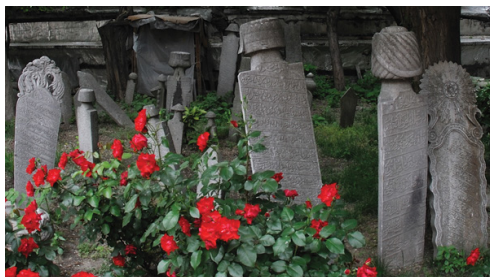
Figure 5: An Ottoman cemetery, in the very heart of the city, nearby the main mosque (Internet).