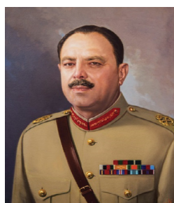
Figure 2: Ayub Khan M (1907-1974) (Internet).