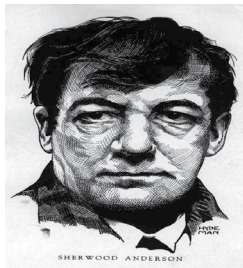
Figure 4: Sherwood Anderson, Writer of the above-mentioned story (Internet).