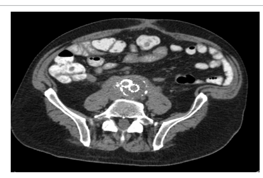
Figure 1: CT scan demonstrating dense fibrosis encasing the aorta and both ureters. Note the endovascular stent within the aortic aneurysm.

Preoperative urodynamics revealed a normal capacity bladder, adequate bladder function, and no outlet obstruction. Bilateral ureteral stents and nephrostomy tubes were also in place. A urine culture was obtained and culture appropriate antiobiotics were administered perioperatively.