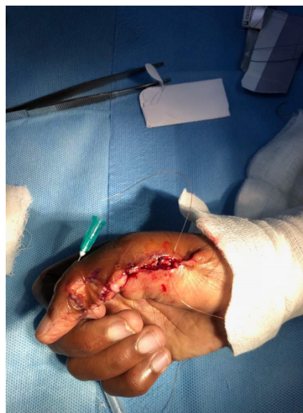
Figure 3b: Contracture release done and flap donor site closed primarily