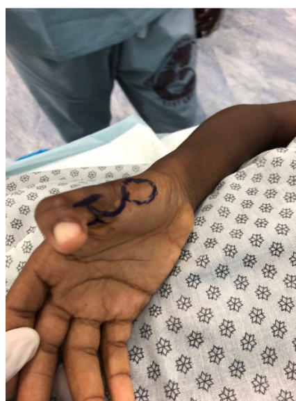
Figure 3a: Markings made for contracture release and homodigital flap.

Nine year old girl presented with a seven year history of post burn contracture. Flap design markings were done (Figure 3a). An H incision was used to release the contracture and the post release wound was covered with the homodigital flap. Due to skin laxity, the flap donor site was closed primarily (Figure 3b).