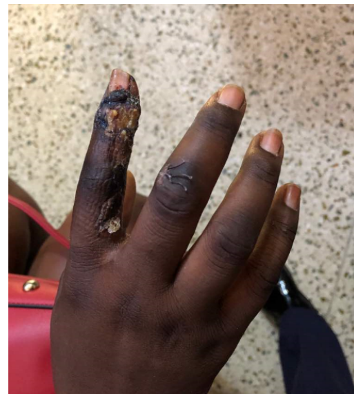
Figure 1d: The Finger on Post-operative day 21.