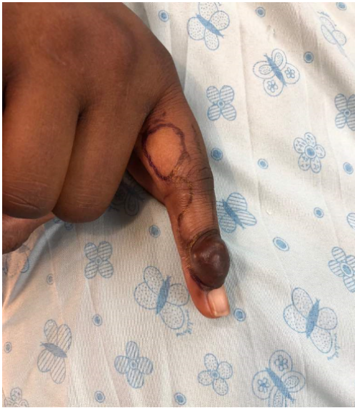
Figure 1a: Fibroma of the dorsum of Distal Phalanx of the Right Index Finger.