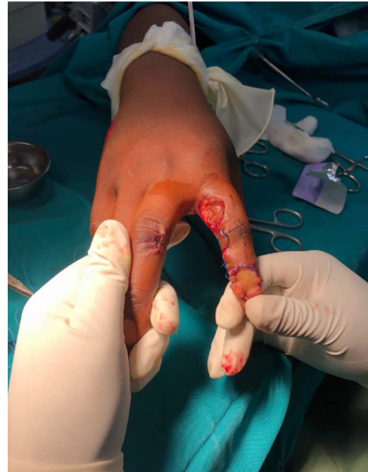
Figure 1c: Flap secured at the excision site, raised flaps sutured back into position, the donor site covered with STSG.