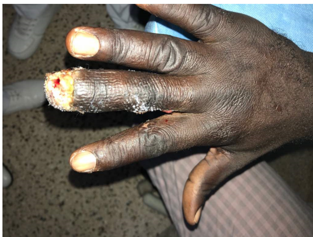
Figure 2b: Finger lengthening done, finger post-operative day 15