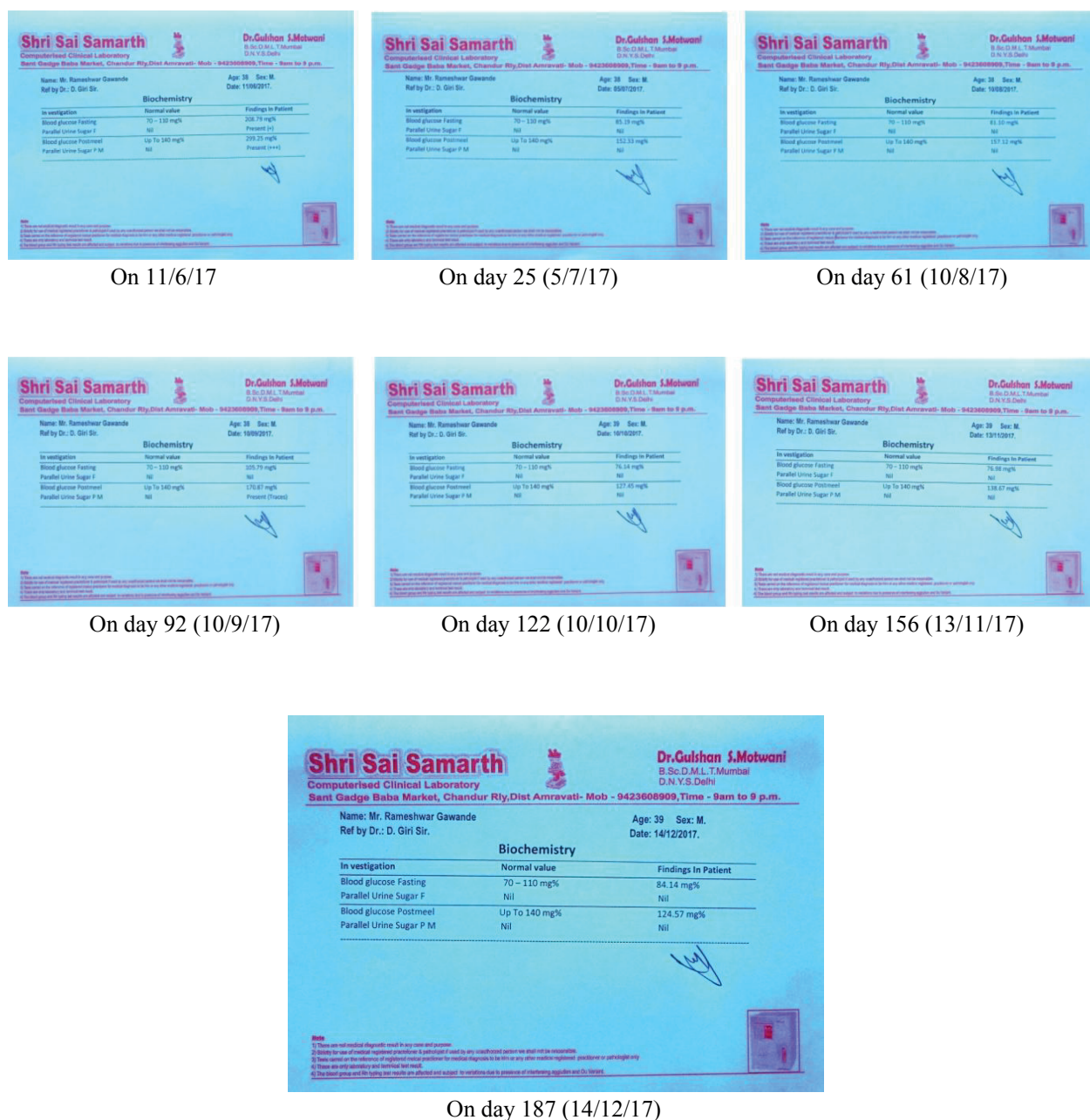
Figure 2: Laboratory BSL reports of 6 months consecutively.

alterations caused by renal ischemia in diabetic rats [37]. Many reports have advocated the nutraceutical potential of Terminalia chebula [38,39]. Thus Tab.Dtox-OD (tab.of Terminalia chebula ) might have played a role as Preventive, Curative and Rejuvenative medicine in the present case study.