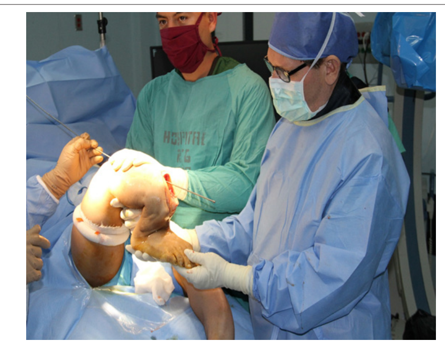
Figure 4: Placement of guidewire for intramedullary rod.