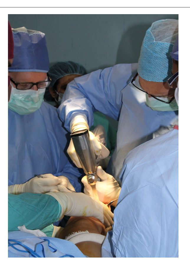
Figure 5: Osteotomy of tibia.