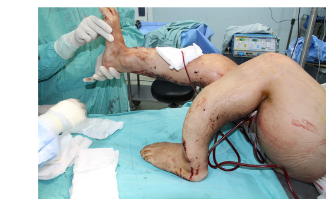
Figure 9: Right tibia and fibula surgical correction of bone deformity.

In addition to the interventions to combat signs, symptoms, and underlying causes of osteogenesis imperfecta, routine preventive care and intentional nutritional strategies can promote health and are important in osteogenesis imperfecta. For instance, because bone health relies on calcium and vitamin D, dietary intake of these nutrients is important in osteogenesis imperfecta, as is maintaining a healthy weight through a balanced diet so that excessive strain is not placed on fragile bones [30].