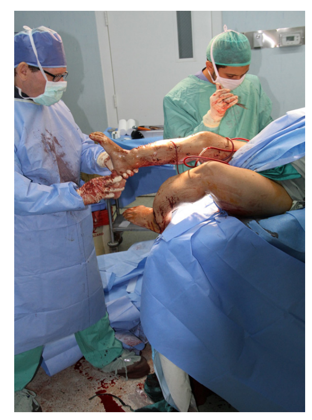
Figure 8: Right tibia and fibula surgical correction of the bone deformity.