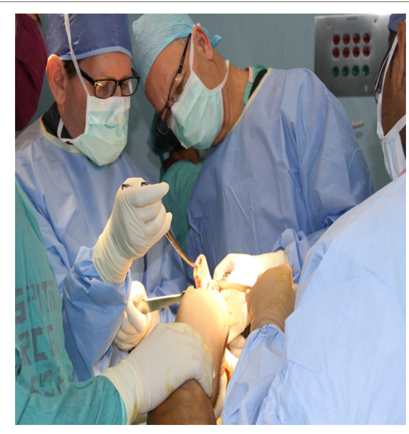
Figure 6: Surgical manipulation of tibia into appropriate position.