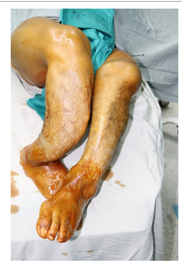
Figure 2: Bilateral lower extremity deformity due to Osteogenesis Imperfecta (OI).

Figure 1: Bone deformity secondary to osteogenesis imperfecta.