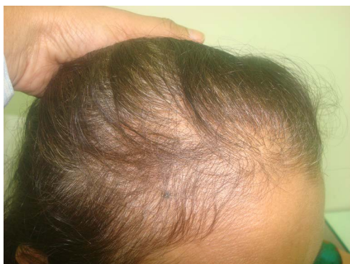
Figure 5a: Hair loss in a female architect working in dust and cement.