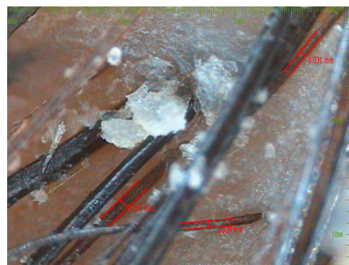
Figure 2a: Trichoscopic evaluation of dandruff and hair caliber before treatment.

Unusual case of hair loss from effects of electromagnetic radiation from a cell phone: