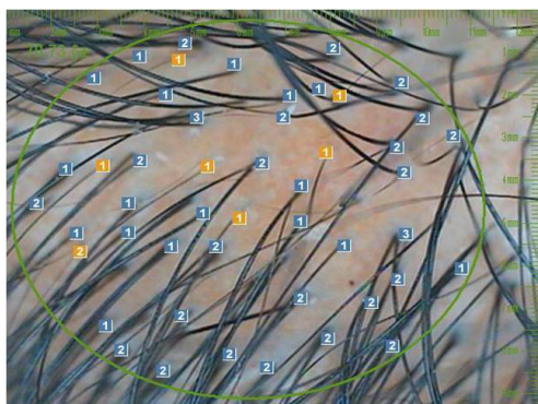
Figure 1a: Trichoscopic hair counts before treatment.