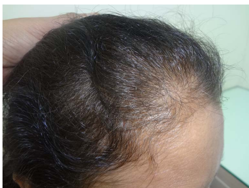
Figure 5b: Improved hair growth in 4 months with antioxidant therapy and hair care program.

hair loss mimics AA and may be difficult to distinguish clinically unless suspected and confirmed by the treating doctor.