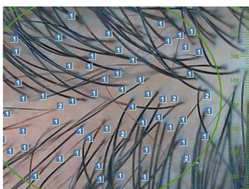
Figure 1b: Trichoscopic hair counts showing 24% improvement after 4 months of care program.