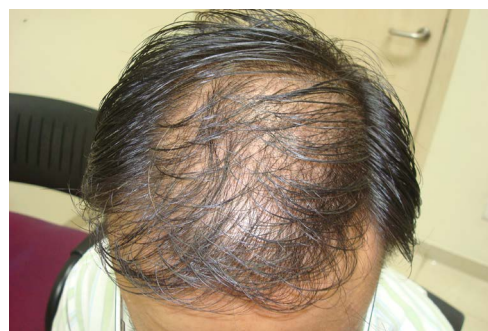
Figure 4a: Hair loss in a person working on Petroleum transport ship.

Philpott demonstrated in his experiments that pollution levels increase oxidative stress on the hair follicle cells, leading to increased hair shedding, similar to the mechanism seen in persons suffering from androgenic alopecia (AA) [18]. Which implies that pollution induced