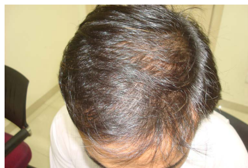
Figure 4b: Improved hair growth in 4 months with antioxidant therapy and hair care program.