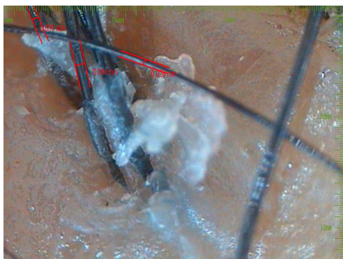
Figure 3: Redness from scalp irritation and itching caused by pollution.

We encountered a patient with unusual hair thinning on the left temporal and parietal area, around the left ear. The patient had developed a hair less patch which did not show exclamation mark hair or signs of alopecia areata on trichoscopy. Patient had history of prolonged cell phone talk with continuous long conversations holding the phone by pressing it between the left shoulder and the ear. Patient could recall at least 18-20 business conversations of more than 20 minutes duration every day for past 9-10 months. This was 6-7 hours of cell phone usage per day. On review of literature we found an interesting study showing single-strand DNA breakage in human hair root cells exposed to mobile phone radiation [13]. According to the study these changes are temporary and normal healthy cells are capable of complete recovery from such effects [13]. The patient was advised to reduce cell phone conversation time, use hands free option instead of holding the phone to the ear and follow the hair care program for protection of hair and stimulation of hair growth. Patient reported good benefit beginning to show improvement within 2 months. The regrowth of hair with improved density and hair caliber can be appreciated. The additional response all over the scalp is due to application of minoxidil all over and generalized benefit of antioxidants on hair roots all over the scalp.