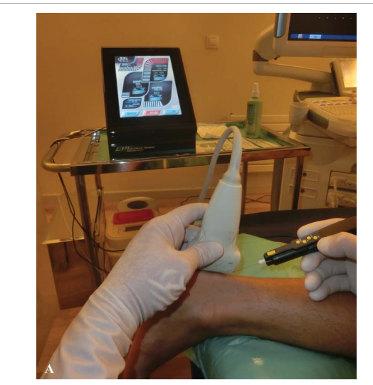
Figure 2A: Treatment of Achilles tendinopathy with ultrasound-guided EPI<sup>®</sup> technique (EPI Advanced Medicine<sup>®</sup>, Barcelona, Spain).

The EPI<sup>*</sup> technique (Figure 2) achieves a very localized organic reaction in the clinical focus by using a specially designed EPI<sup>*</sup> device for this purpose (EPI Advanced Medicine<sup>*</sup>, Barcelona, Spain. EPI<sup>*</sup> technique videos online: www.epiadvanced.com), which leads to the rapid regeneration of degenerated tissue. This leads to the production of new immature collagen fibers that become mature by means of eccentric stimulus [32], thereby obtaining good results in the short and