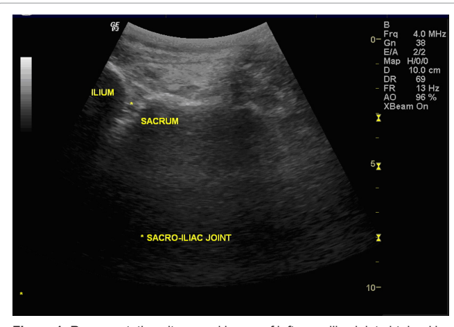
Figure 1: Representative ultrasound image of left sacroiliac joint obtained by use of a 4MHZ Curvilinear transducer.