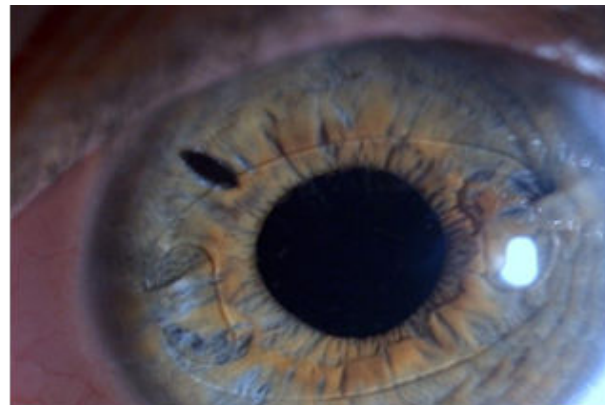
Figure 4: 2 years postoperative picture.

As regards post-operative complication there were 2 eyes presented with mild anterior uveitis that improved on topical steroids after one week, 2 eyes with pigmented deposits on lens surface, and 2 eyes, 2 eyes had ovalization of the pupil and one case of cystoid macular edema.