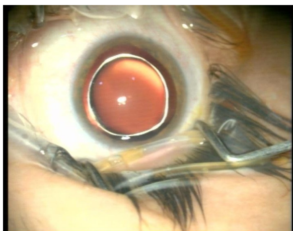
Figure 3: A case of microspherophakia.