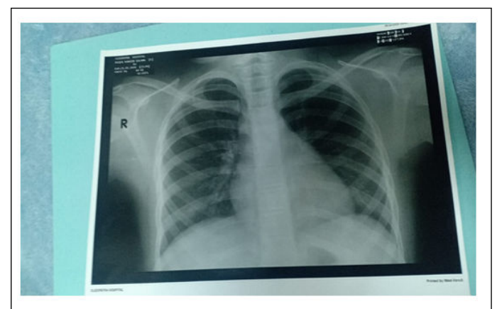
Figure 3: Plain x-ray shows almost normal findings.