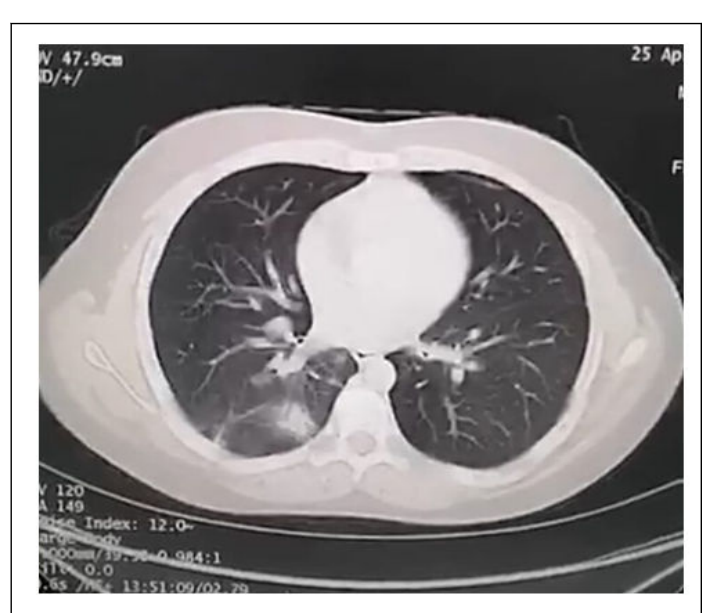
Figure 2: CT scan shows right lower lung lobe with ground glass densities.