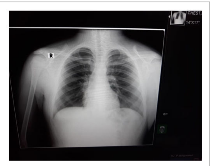
Figure 1: Plain x-ray shows a mild increase in the bronchovesicular markings.

Although the child did not complain of any chest symptoms or even cough, Chest X-Ray (CXR) and CT scan were done. CXR revealed a mild increase in the bronchovesicular markings. (Figure 1) CT scan showed the right lower lung lobe with subsegmental patchy areas of air space consolidation with ground-glass densities of infectious or inflammatory origin. (Figure 2). The patient was home isolated, and the initial medication was started as oseltamivir oral 75 mg once daily for 5 days, azithromycin oral 20 mg/kg every 24 hours for 5 days, oral paracetamol 20 mg/kg every 6 hours until fever resolved within 24 hours, Vitamin D3 1000 IU/day, Vitamin C 100 mg/day, and oral zinc syrup 1 mg/kg/day. After 10 days, his symptoms improved with 2 negative PCR 72 hours apart. Taste sensation was regained after 2 weeks from discharge. Follow up chest CT scan was free after 1 month from the discharge date.