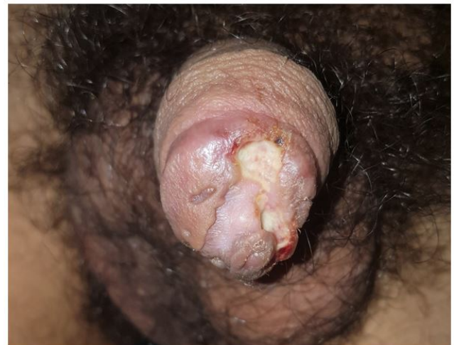
Figure 1: Multiple ulcers with well-defined irregular margins present all around the glans penis

cases have been described worldwide with less than 1% of all genital TB cases reported [2].