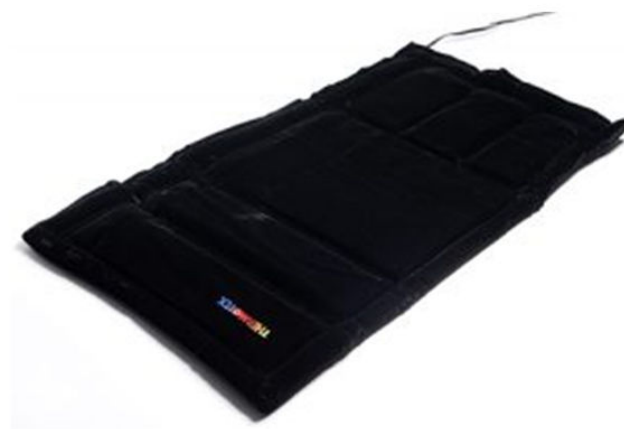
Figure3: Infrared Mat.