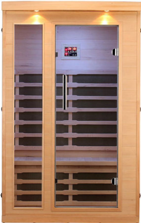
Figure4: 2-Person Infrared Sauna.