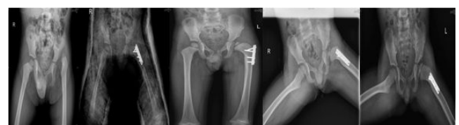
Figure 4: 8 years old male patient presented at the age of 5 years with unilateral DDH operated after 5 months (3years follow up).