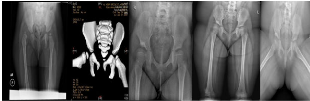
Figure 5: 8 years old male patient presented at the age of one year and eight months age with unilateral DDH operated after 3 months (six years follow up).