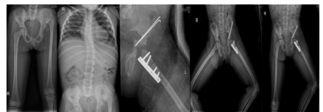
Figure 3: 9 years old female patient presented at the age of 6 years with unilateral DDH, patient operated after 4 months (3years follow up).