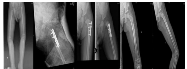
Figure 2: 4 years old female patient presented at the age of 1.5 years with unilateral DDH, patient operated after 3 months (two years follow up).