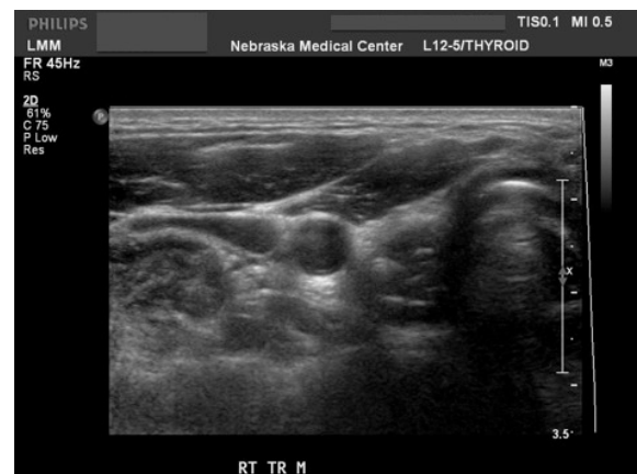
Figure 1: Thyroid ultrasound transverse view showing hypoechoic nodules in the right thyroid bed with microcalcifications.

CEA remained stable at 2.1 and calcitonin was again undetectable. To help further define the nodules, a soft tissue neck CT scan of the neck with and without contrast, revealed a 3.6×0.6 cm tracheal cyst along