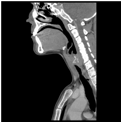
Figure 3: Computed tomography sagittal slice of the neck soft tissues with contrast showing tracheal cyst.

the right posterolateral trachea within the thyroid bed (Figure 2 and 3). This cyst correlated with the previously seen right thyroid bed nodule on ultrasound. No other pathologically enlarged nodules or lymph nodes were identified. We elected to monitor the cyst with a repeat CT scan in 6-9 months. She remains asymptomatic.