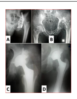
Figure 3: Male patient 24 years old with posttraumatic hip arthritis due to fracture acetabulum; A) X-ray after plate fixation of the acetabulum, B) X-ray after plate removal C) postoperative X-ray; D) X-ray 2 years postoperative.

Figure 2: Male patient 22 years old with hip arthritis due to ankylosing spondylitis; A and B) preoperative X-ray; C) postoperative X-ray; D) 2 years postoperative X-ray.