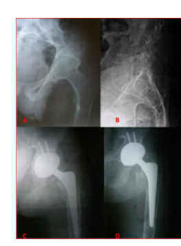
Figure 2: Male patient 22 years old with hip arthritis due to ankylosing spondylitis; A and B) preoperative X-ray; C) postoperative X-ray; D) 2 years postoperative X-ray.

ankylosing spondylitis in 20 patients (Figure 2), and posttraumatic hip arthritis in 20 patients (Figure 3) (Table 1).