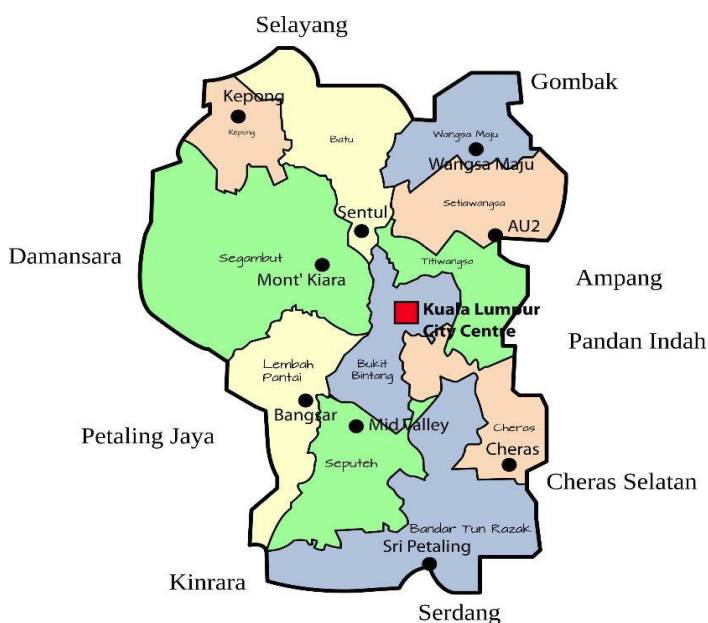
Figure 2: Location of Laman Standard Chartered Kuala Lumpur.